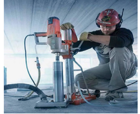
Core sampling to detect chemical contamination in concrete flooring

The purpose of this paper is to provide laboratory researchers and engineering/facilities staff a basic understanding and overview of decommissioning basics using a multi-phased approach to identify, document, manage, and clean up areas of environmental concern and minimize potential liability.